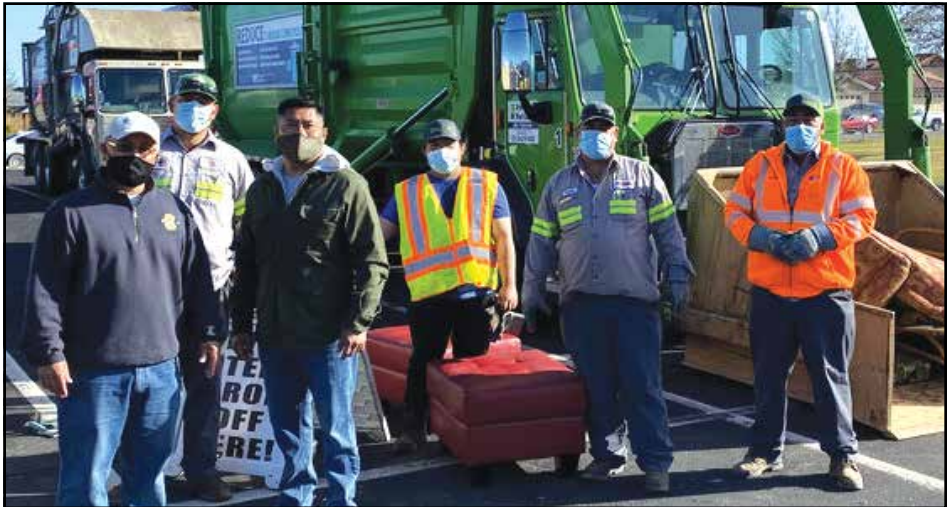
The bulky waste event will be in the courthouse parking lot.