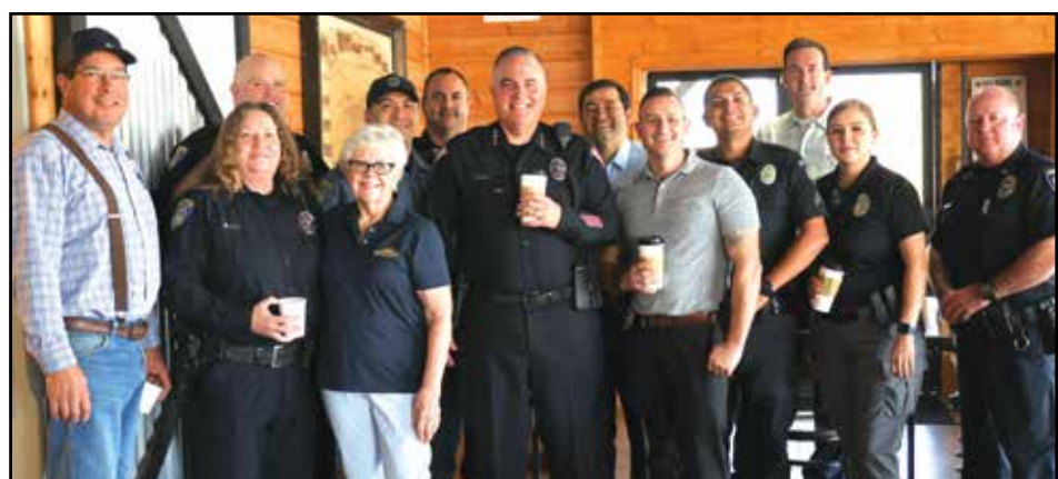
Members of the Shafter City Council and city staff with officers from the Shafter Police Department.