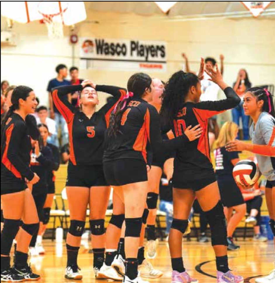
The varsity team was relieved and excited after winning their first set against CCHS.