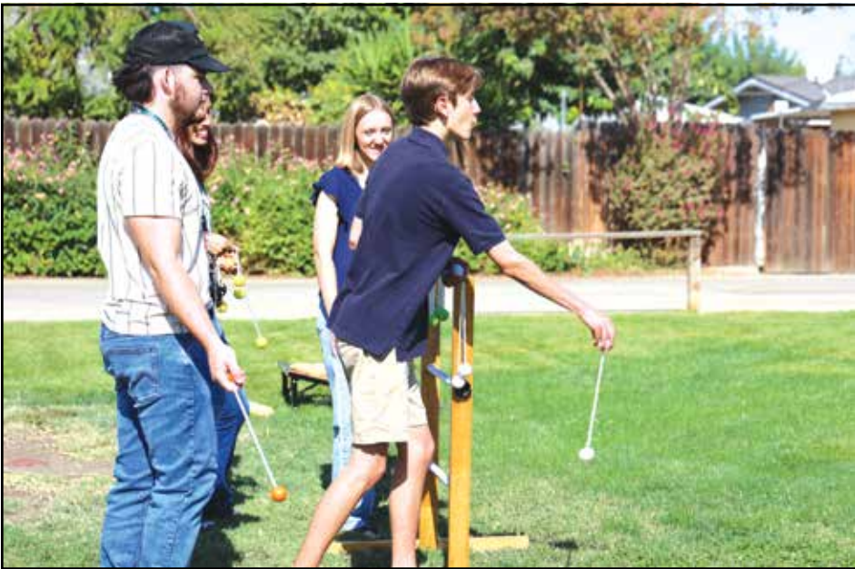
There were plenty of games for the kids to play.