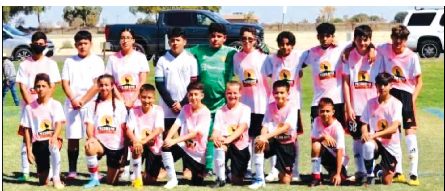
Amigos F.C. soccer team.