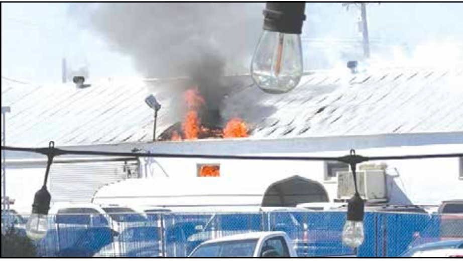
Flames shot out of the shop.

Training will occur on Friday, Sept. 15, from 1 to 2:30 p.m. at Karl Clemens Elementary. To sign up or for more information, contact Tara Rojas at 661-758-7120 or tarojas@wuesd.org.