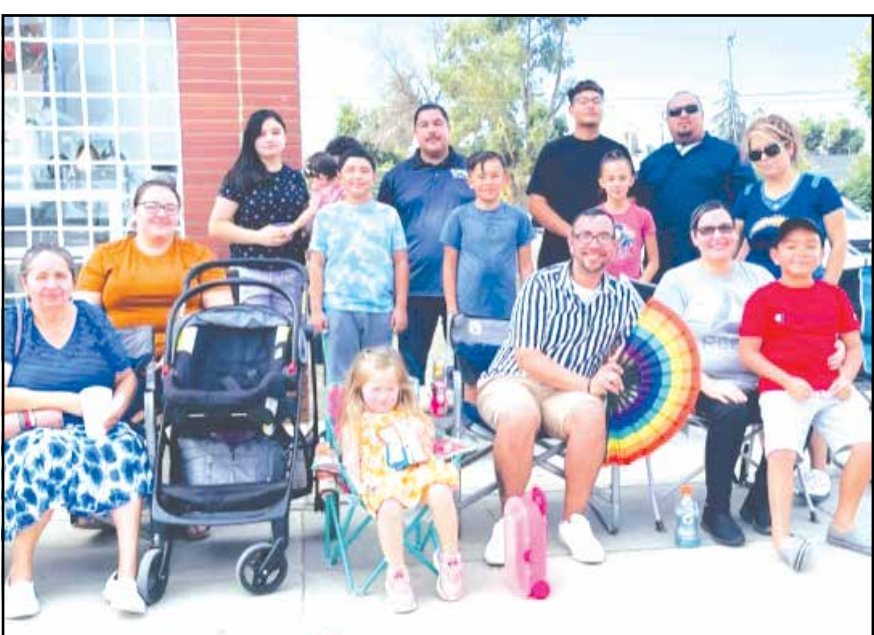
Crowds lined the streets at the 2022 parade.