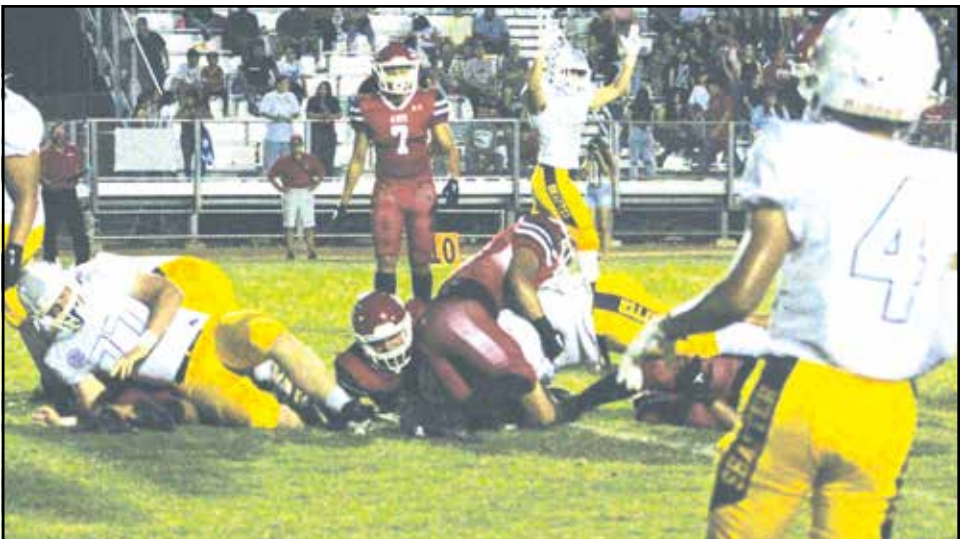
The Generals' defense recovers a fumble.