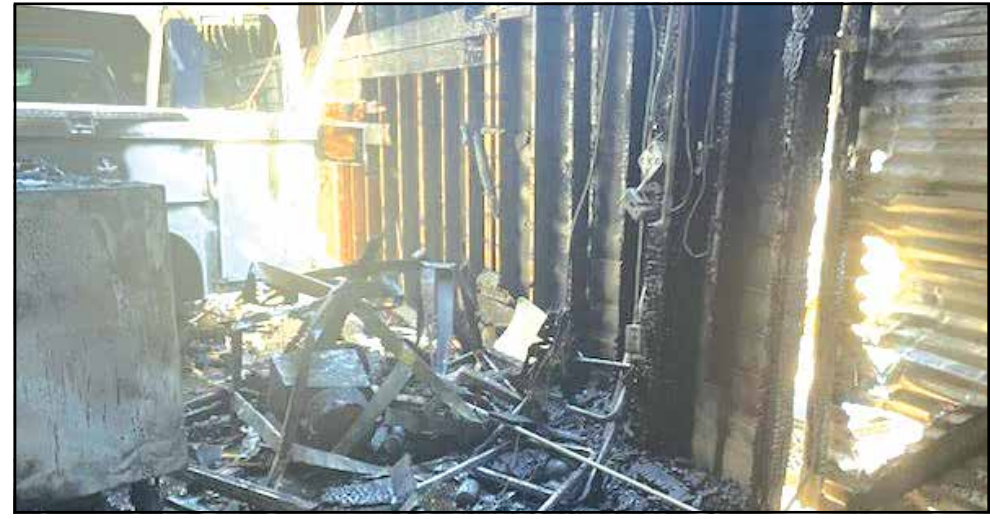
The majority of the back shop was involved in the blaze.