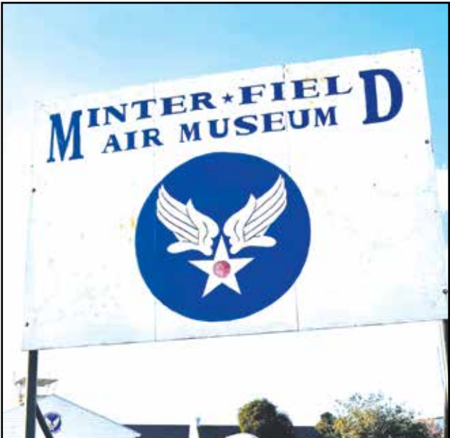
The entire museum will be getting a repainting.