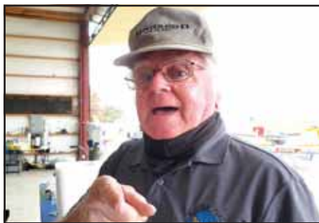
The Fly-In Breakfast attracted a number of pilots who stopped by for a free breakfast.

pilots. Vintage airplanes were on display, as well as the museum, which was open for the attendees to peruse after eating. The museum holds memorabilia from every conflict that the United States has been involved in. They have an inventory of antique war birds, in addition to several military vehicles, such as Jeeps, and one of their most popular crafts, the LOACH helicopter that was used in several battles throughout history. According to Ronald Pierce, of the Minter Field Air Museum, the organization was trying to think what they could do to offset