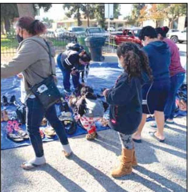
Attendees browse the Love Wasco event at Canyon Hills Church on Broadway.

It's been a long time since a physical event has taken place in town, and Canyon Hills started off the Thanksgiving season with a free outdoor clothing and lunch giveaway. Attendees were all grateful that the