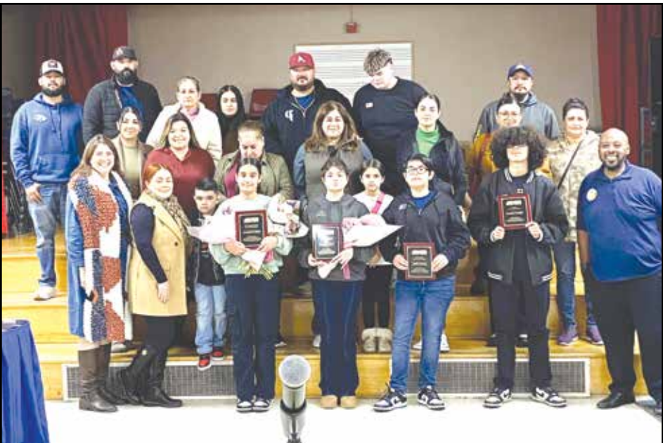
The honored students with their families and staff.