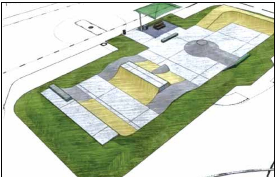
A rendering is of the new proposed skatepark in Shafter.

million. There are other projects that have the Public Works Department working hard to making the city beautiful, as well as functional. Almost near completion is the James Street Streetlight Enhancement Project, which has the addition of new street lights along James Street, getting the area well-lit and more attractive. A project that will be started construction on in the first quarter of 2024 is the long-awaited Shafter Aquatic Center improvement project. The project will cost about $3 million and is being funded by a federal grant. Construction will begin in early 2024, with this phase of the project focusing on making the pool functional and possible to be reopened. It is expected to be completed by the summer of 2024. Also beginning construction next month is the Skatepark Equipment Replacement Project. Located East Euclid Avenue, at the site of the Shafter Youth Center, this project will include new skate park equipment, resurfacing of the con-