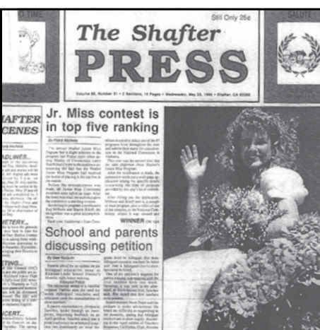
The Shafter Press front page, May 23, 1990.