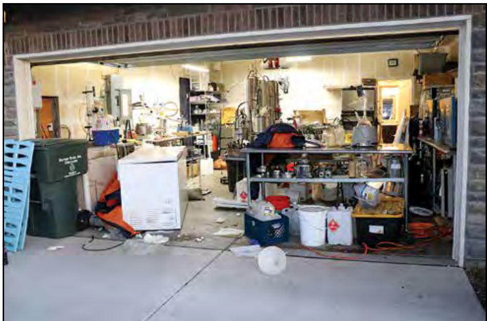
The garage of a Shafter home contained equipment used to process marijuana, police said.