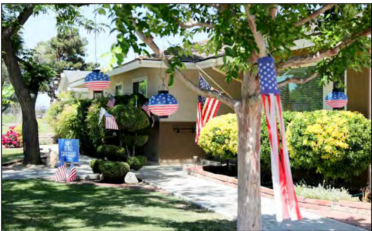
Colleen Diltz has her home decked out in red, white and blue.