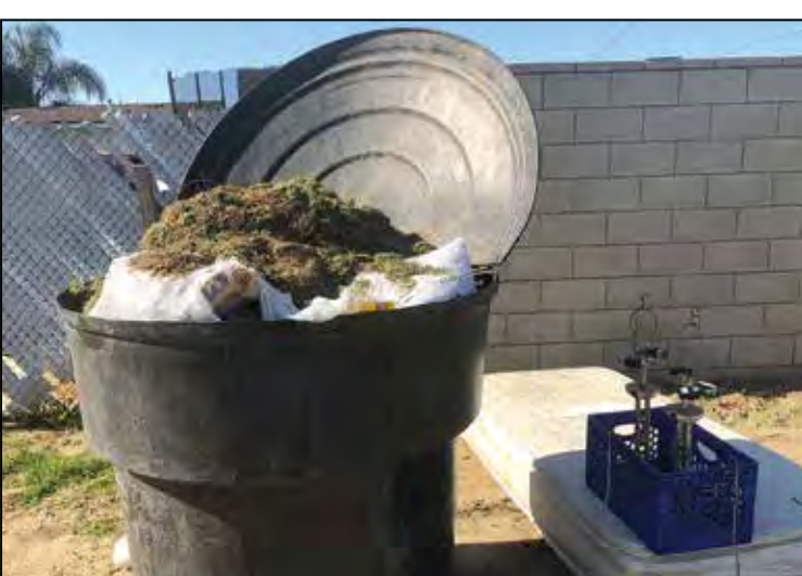
An alleyway off Atlantic Avenue in Shafter.