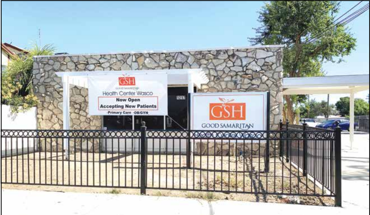
The street view of Good Samaritan Medical Clinic.