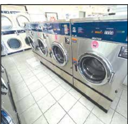
One of 25 modern, state-of-the-art washers at the laundromat.

"For example, If you go on vacation and don't have time, call us, and we will take care of it for a very reasonable price and a