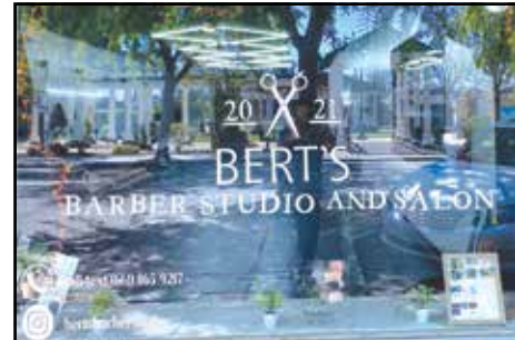
Bert's Barber Studio and Salon take walk-ins and appointments.