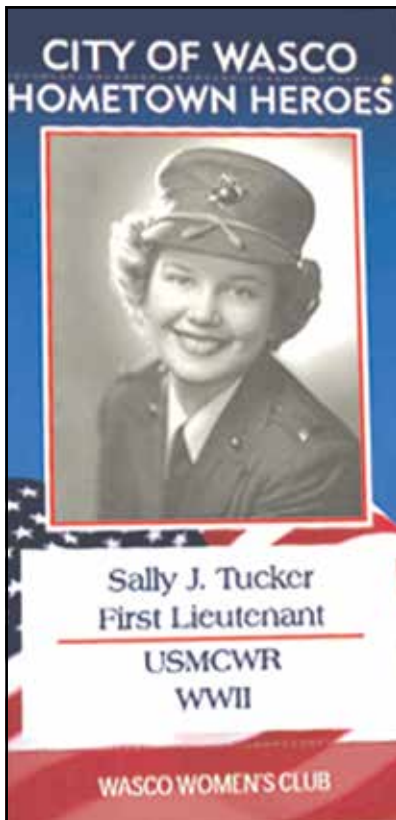
A sample banner pays tribute to Wasco veterans' service and sacrifice.