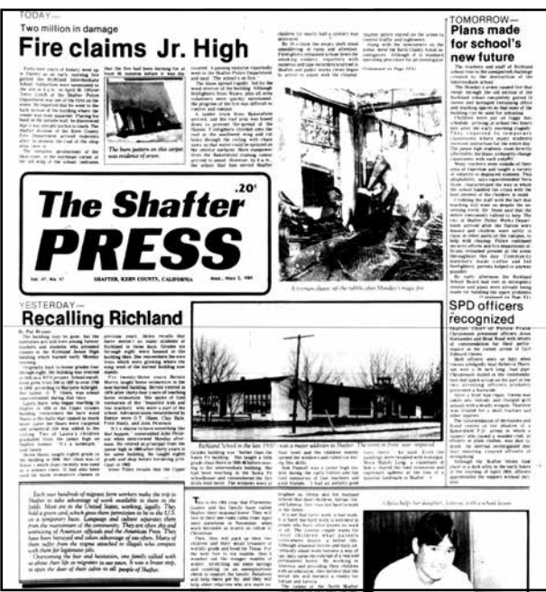
The front page, May 2, 1984