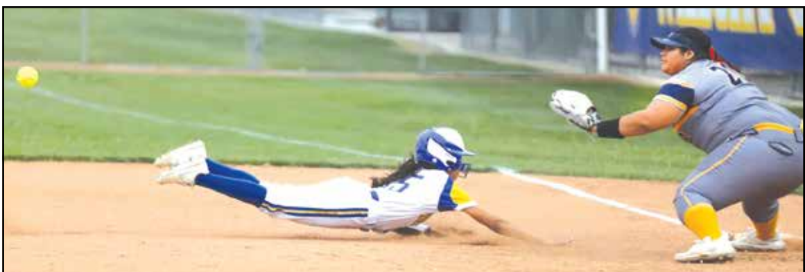
A close play at first.