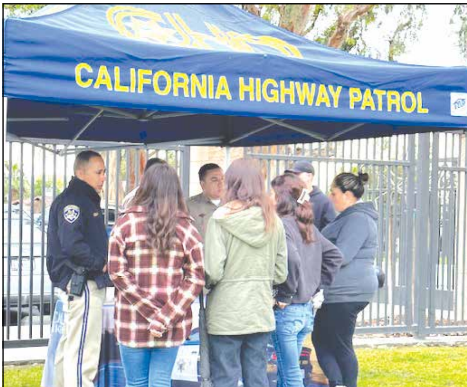
Community members visiting the Highway Patrol booth at last year's event.

Some colleges attending include Aeronautical University, Los Angeles College of Music and Milan Institute. There also will be informational booths about Job Corps recruitment and career exploration, and migrant and seasonal Head Start pro-