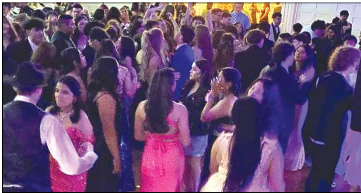
The dance floor was busy all night.