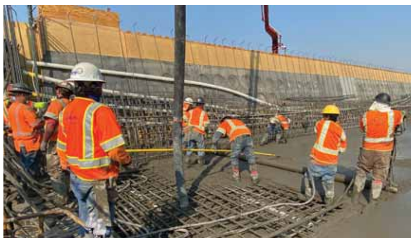
Pond Road Viaduct