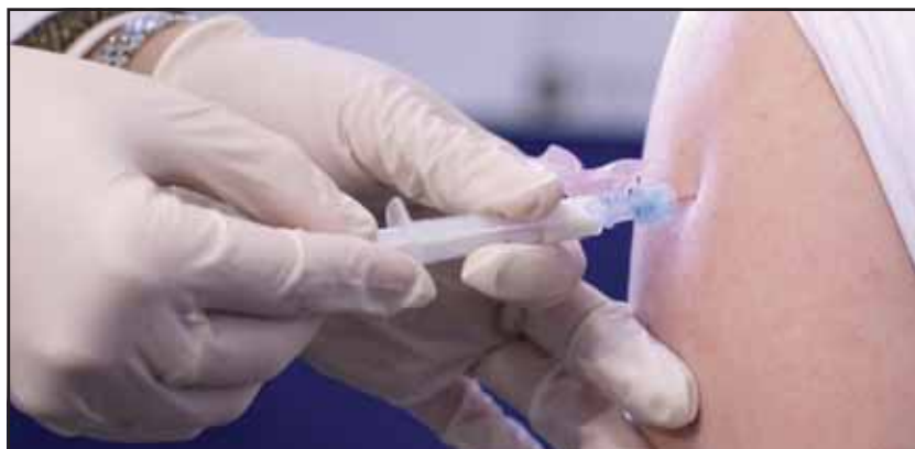
Garza stressed that it is important to get your flu shot, especially with the threat of the coronavirus also lurking out there.

In conjunction with the flu shot clinic, the Kern County Latino CO-