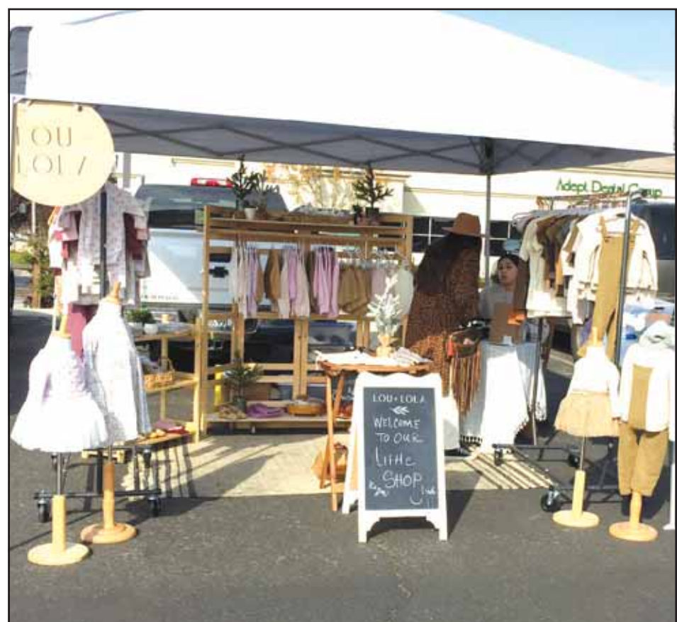
LOU + LOLA had a variety of clothing on display.

looking at all the different businesses. I didn't realize how many people we have in Shafter and around here that offer such a variety of things to buy. I bought some awesome food and a couple of handmade belts that my kids love. We also bought a couple of purses. All in one event, this is great!"