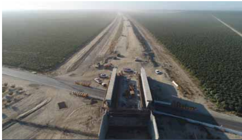
Garces Highway Viaduct