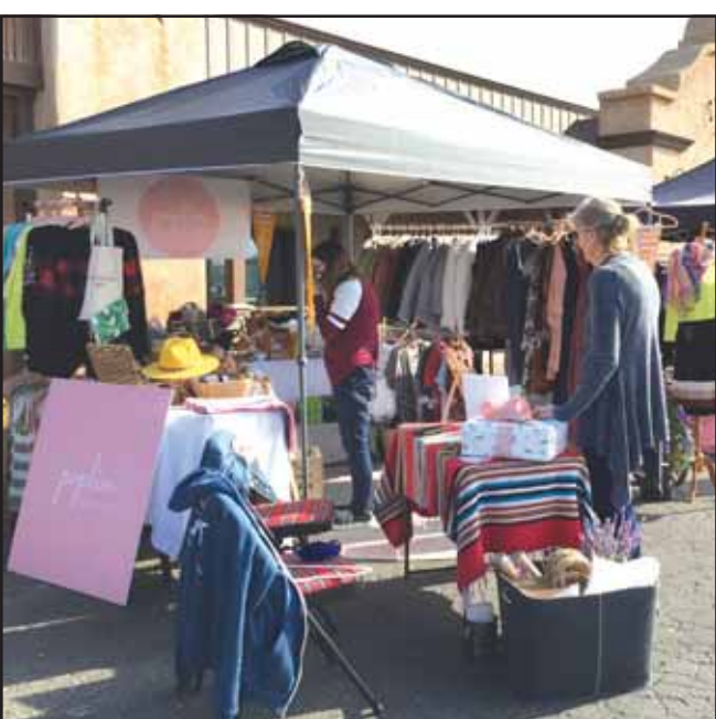
Local vendors were selling their wares at the event.