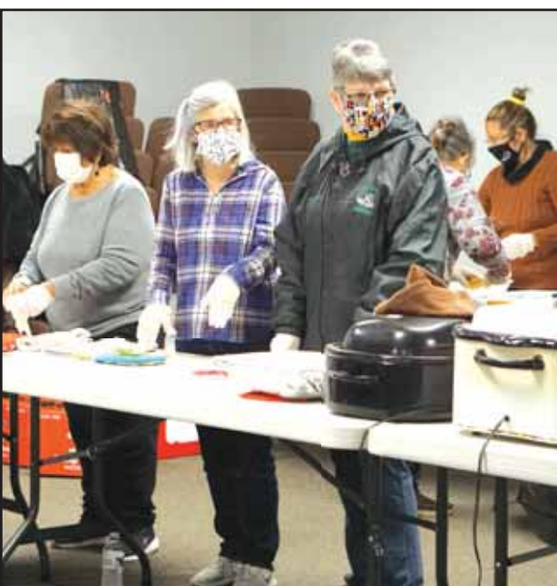
Volunteers that put the plates together.

Grace Community Church has its Sunday service at 10 a.m.