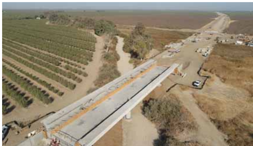
Poso Creek Viaduct