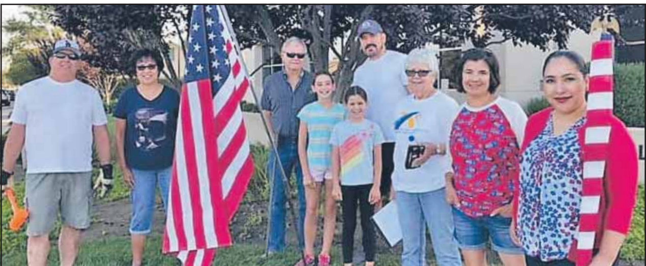
The Shafter Rotary Club made a trail of American flags leading to the event.