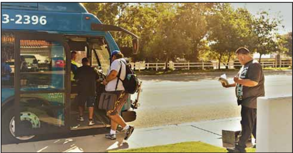
Passengers boarding bus 110 at Shafter's bus stop.