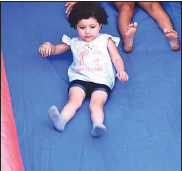
The big slide was a draw at the event.