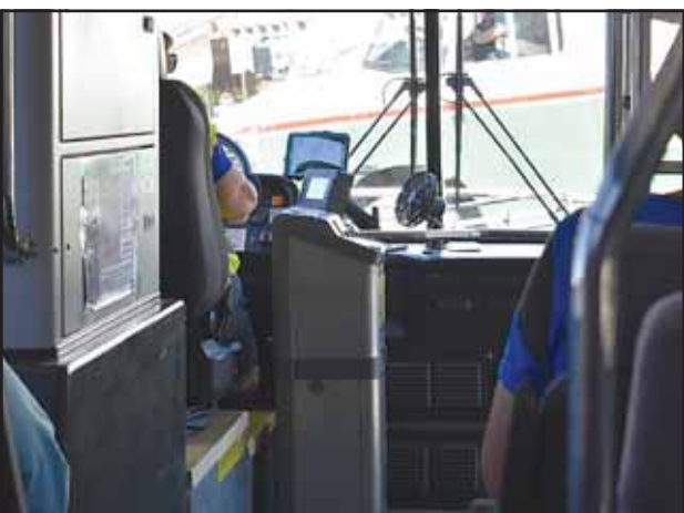
Inside bus 110 en route to Shafter and Wasco.

"I had a student thank me for taking them to school because they wouldn't have had a consistent ride. They felt reassured