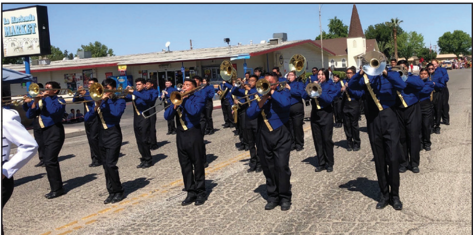
The band playing at a field competition.

many live events, such as plays, music programs, sporting events and assemblies.