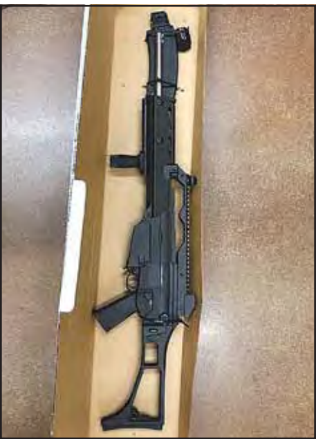
This semiautomatic weapon was seized as part of the probation search involving five different agencies.

He expects similar operations to be conducted in the future.