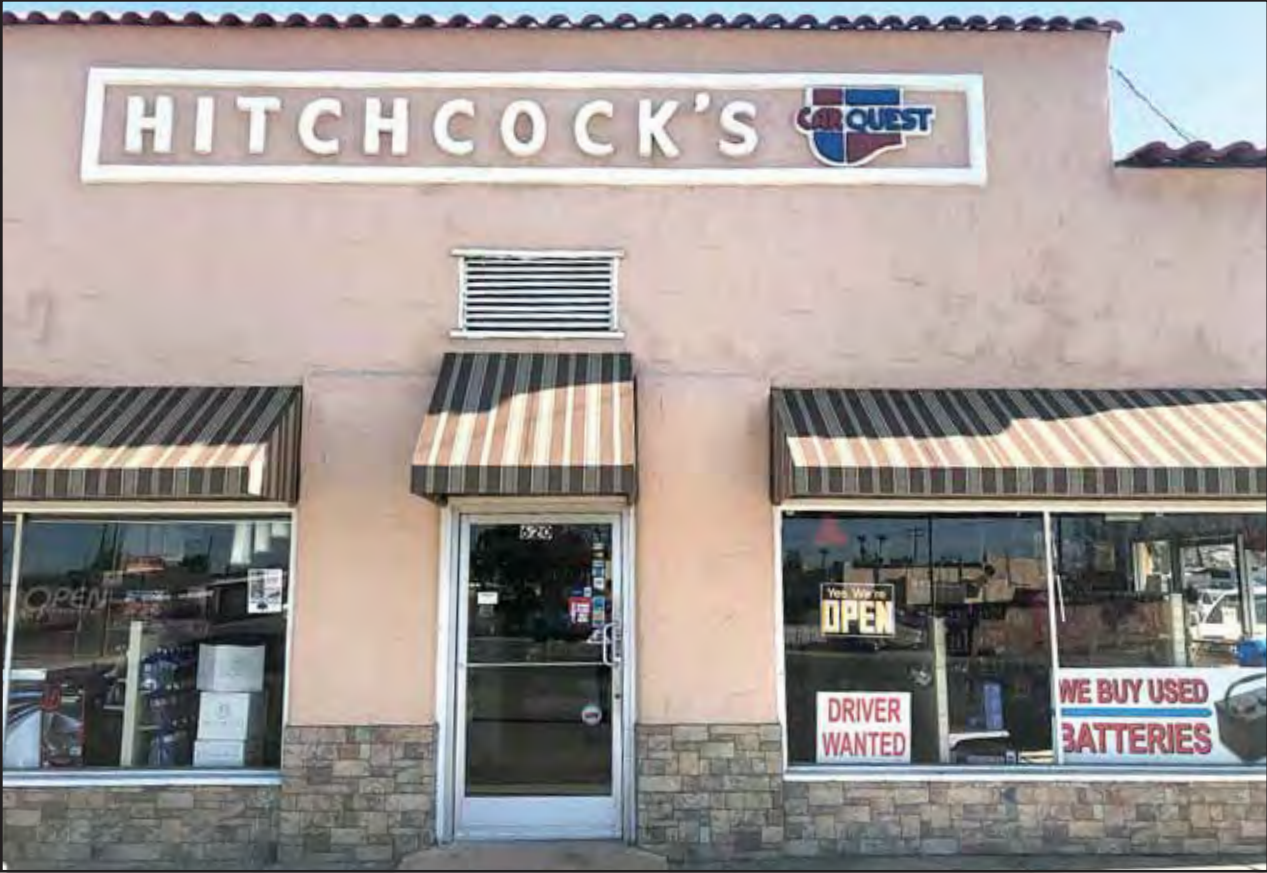
Hitchcock's has been serving Shafter for over 96 years.