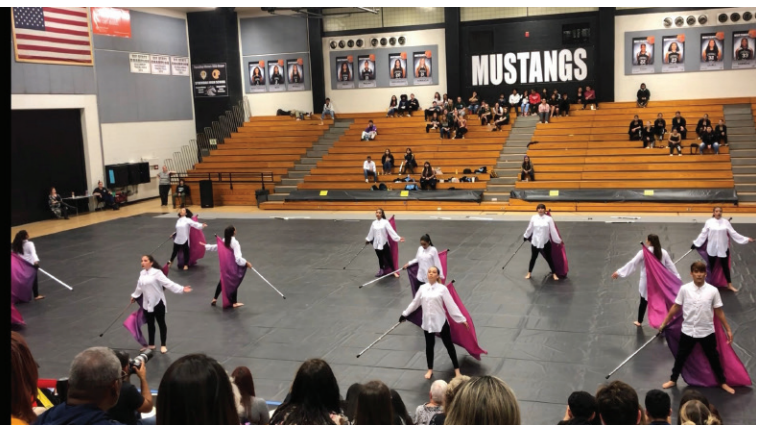
Colorgaurd performing at a competition.

around campus with a unique and tailored approach. The technology the students learn to use in this course are exactly what they will encounter in a real newsroom. Because of the technology available, students film