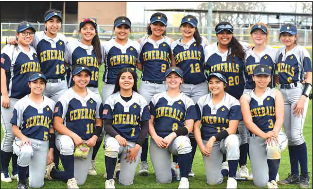
The Lady Generals won the championship in their first tournament of the season.