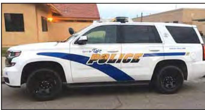
The Taft Police Department was one of seven different agencies involved in the operation.

The operation was a result of a concerted effort between over 50 officers and deputies from seven different law enforcement agencies in Kern County. In addition to the Shafter Police Department, there were officers from the Ridgecrest Police Department, Kern County Sheriff's Department, Delano Police Department, California Department of Corrections, Kern County Probation Department