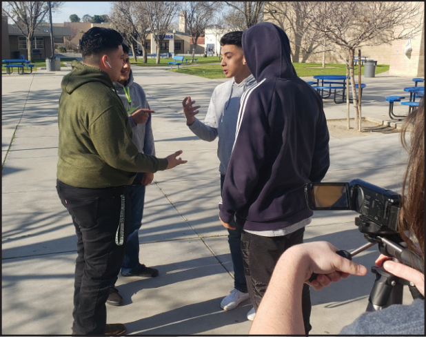
A student working on the video editing software.

The choir program performs at concerts in the