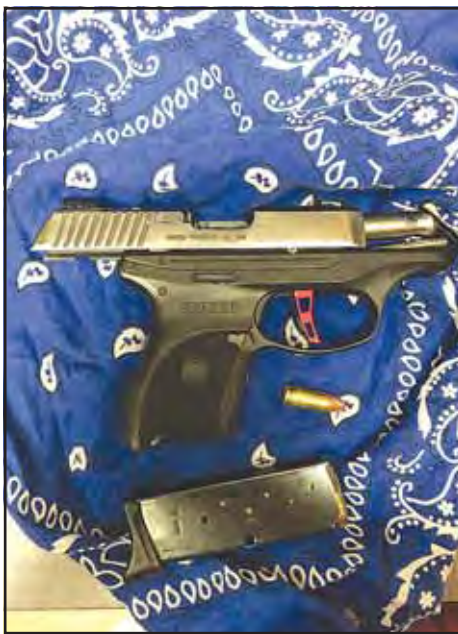
This gun and ammo was found in a check of a felon that was violating his terms of probation.