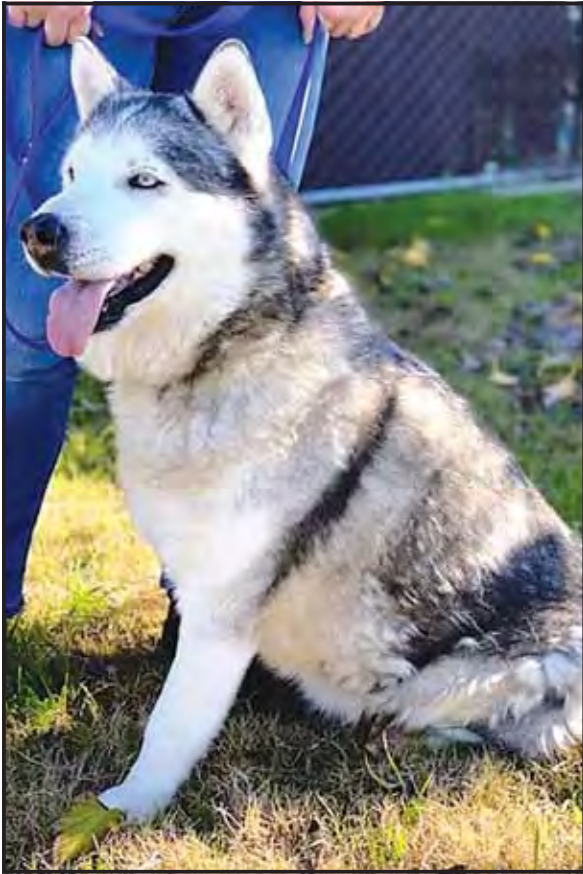
Tulip is a sweet girl who would be a great addition to any home.