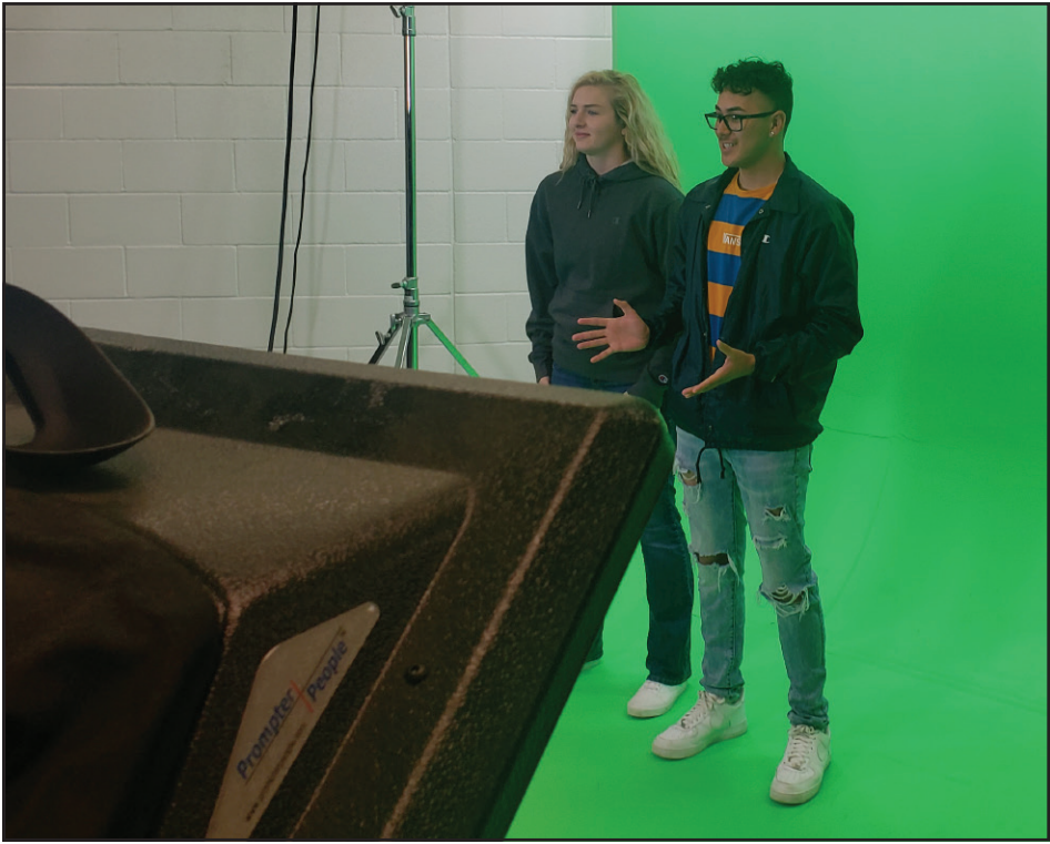
Students recording their own video project.