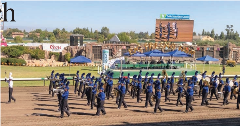
The band performing at a parade.