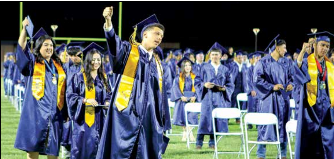
One last Alma Mater.