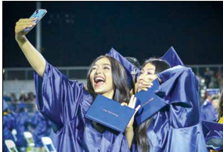
Selfies were the rage.