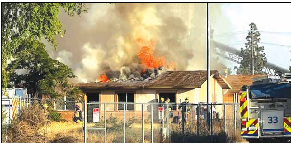
The cause of the former farm labor camp fire is yet to be determined.

tims and extinguishing the fire. No victims were found. There were no reports of injuries on the scene by civilians or firefighters. The cause is undetermined.