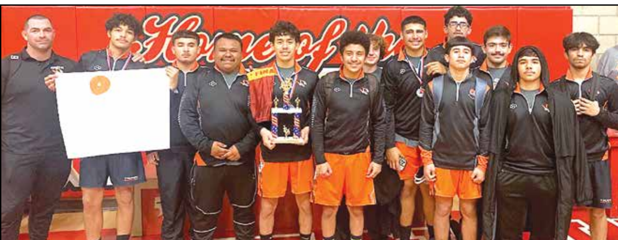
Varsity wrestlers took 5th place as a team.