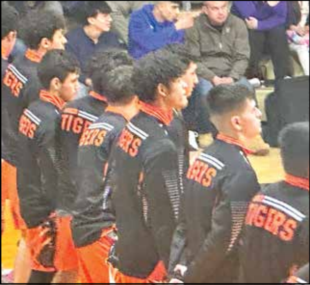
Doing the face-off against Shafter at home.