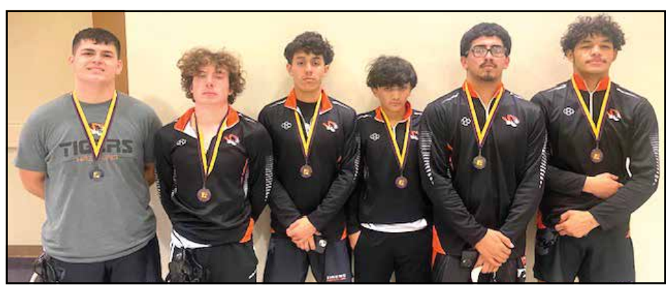
At the Lemoore tournament, where the boy's team placed 4th.