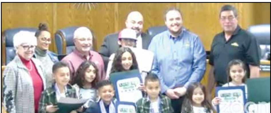
The council recognized the Shafter Striders traveled to Tennessee to compete in the national AAU championships.

SHAFTER city that the dog park was a main component and the reason for the approval of the funds. The council then decided to go forward with the project using other monies, dropping the grant funds from the project. At their regular meeting, the council also gave a proclamation to the Shafter Striders, a local running club that includes children from age 6 to 18. The group traveled to Knoxville, Tenn.. to compete in the AAU Cross Country National Championships. The teams participated in different age divisions, with a 6U team, 7-8 See COUNCIL Page 6