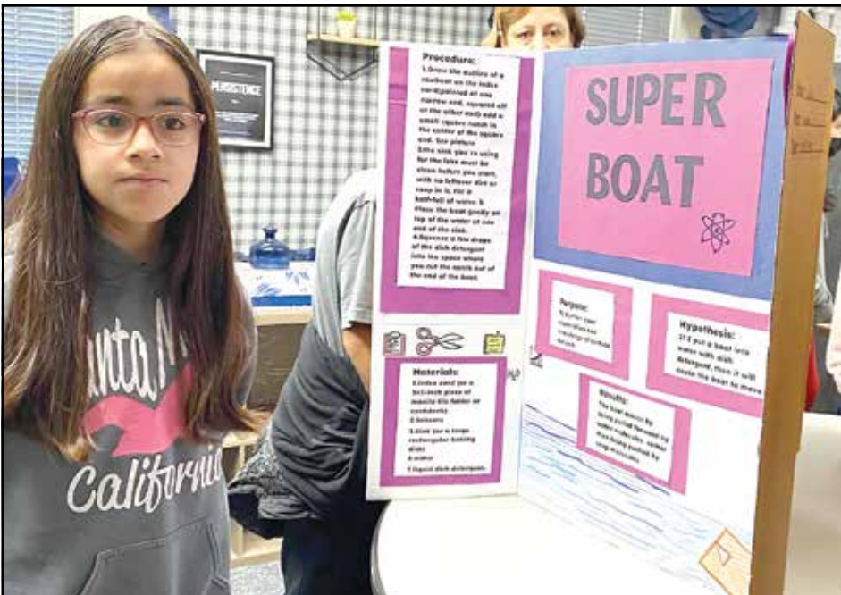
This project involved putting dish soap in a sink of water to see if it would make a paper boat move. RIGHT: This project focused on making a perfect pasta.