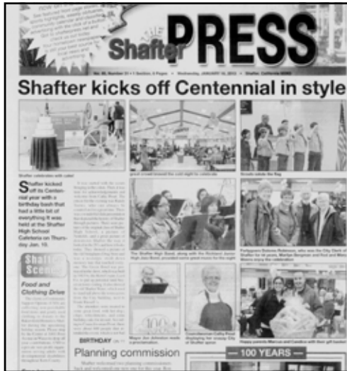
The front page, Jan. 16, 2013