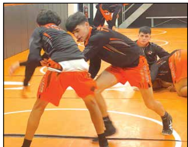
Warming up against Shafter in the practice room.