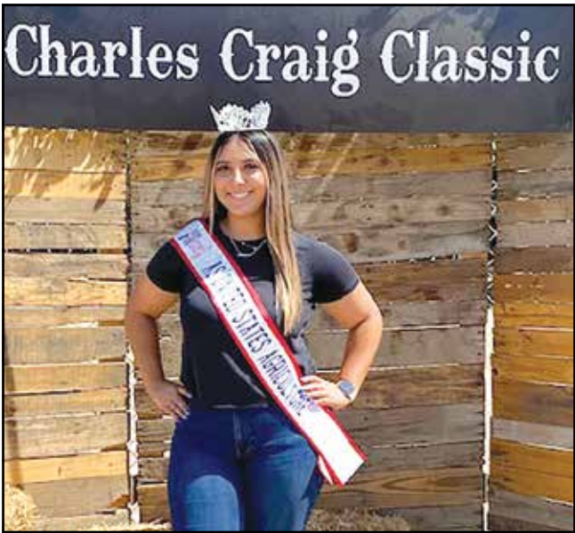
At the Charles Craig Classic FFA livestock show.

“I am about ag literacy and advocacy. My biggest concern is that children and even adults don’t know where their food comes from. My hope is to educate them