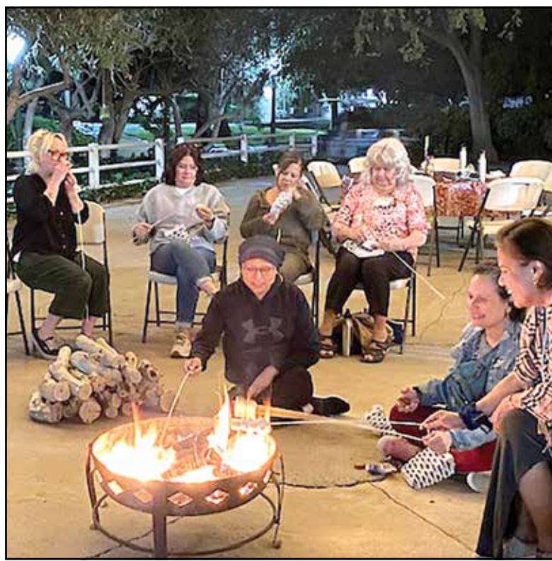
A warm campfire to kick off the retreat.