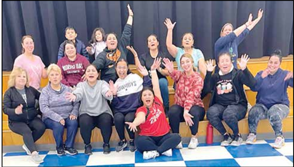
A Zumba class always ends with smiles and lots of enthusiasm.

"Some can not afford a gym membership, so our job is to break down barriers and make it as inclusive as possible for the Wasco community. As a result, we have seen that participants start paying attention to what they drink and eat which translates into them living a better lifestyle."