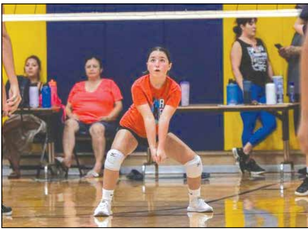
The girls learned proper setting technique.