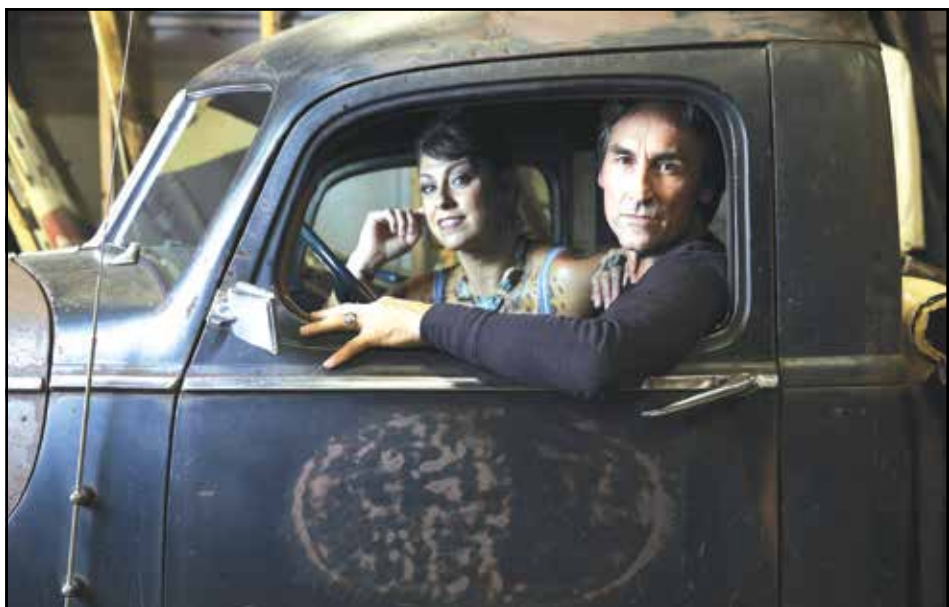
American Pickers' Mike Wolfe and Danielle Colby will be returning to the West Coast.

The team will contact individuals who they think would make a good story. "Everyone has things that mean so much to them, and sometimes those items can mean so much to our audiences, be they big items or small."