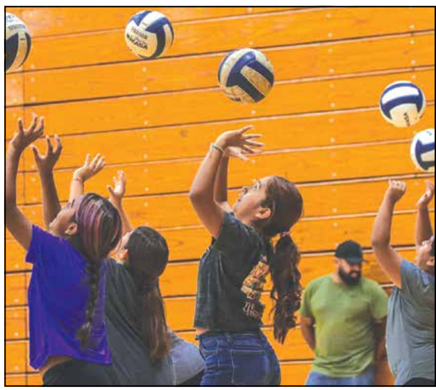
The teams also practiced all phases of the game.