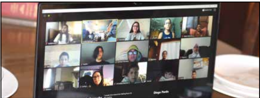
The entire class is connected via ZOOM.

"I think it is important for the kids to get a chance to talk to each other, with a lot of them not being able to communicate with each other as much