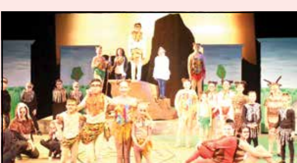
The 25th production of the Children's Summer Theater was this year's The Lion King.

Housed in the auditorium at Shafter High School for the first 20 years, the theater was then moved to its current location at the Ford Theater. "We appreciate Shafter High for all of their years of support, but it is really