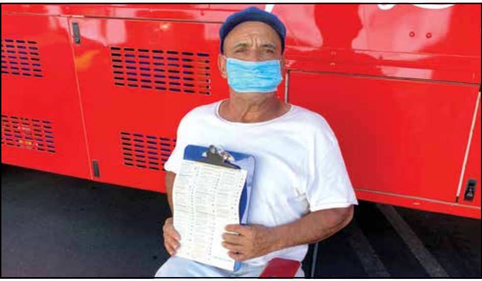
ABOVE: A Houchin blood donor waits for his turn. RIGHT: Students from Palm Avenue School pose with their masks.