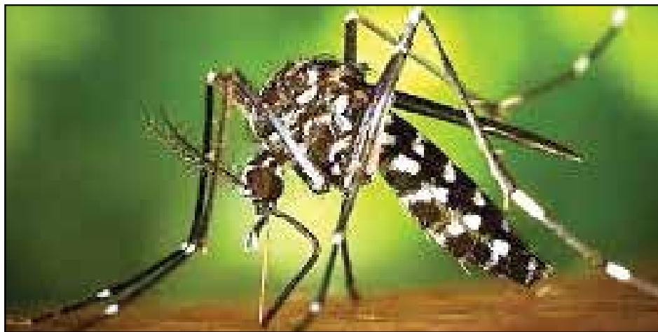
This mosquito uses humans as its main food source.