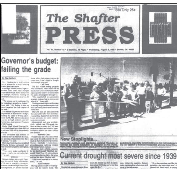
The front page, Aug. 8, 1990