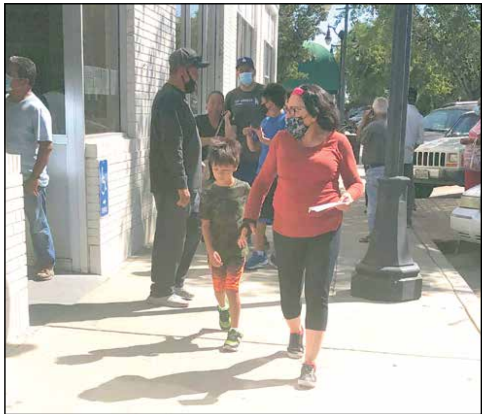
More and more people are wearing masks not just when entering a store but also when they are downtown or walking in neighborhoods in Shafter.