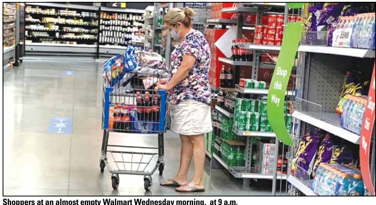
Shoppers at an almost empty Walmart Wednesday morning, at 9 a.m.