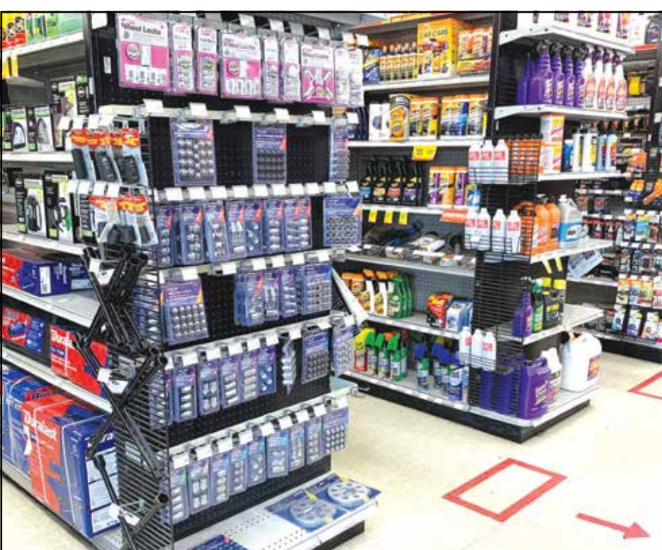
Some of the merchandise sold at Auto Zone.

AutoZone is located at 2301 Highway 46 (Tropicana Shopping Center) and can be reached at 758-4322. The store is open Monday through Friday from 7:30 a.m. to 9 p.m. and Sundays from 8 a.m. to 9 p.m.