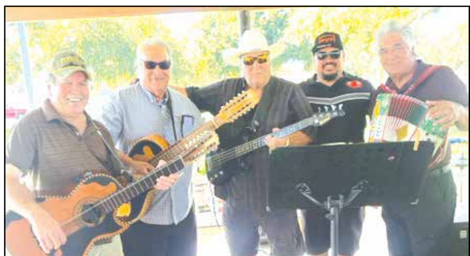
There was live music at the party by the band Los Burgeños.