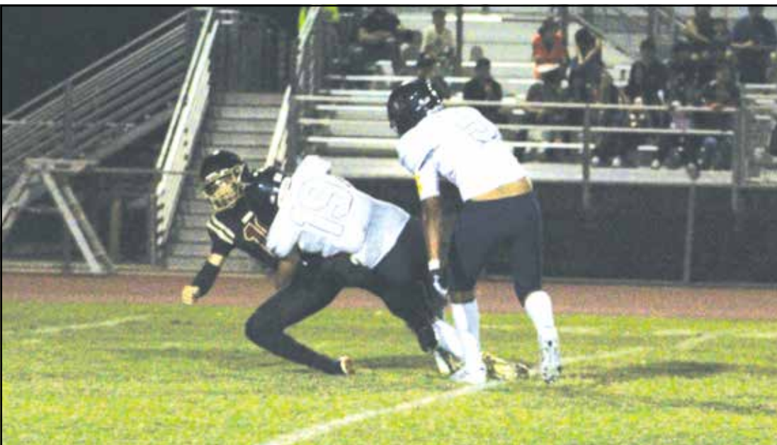
The Generals' defense harassed the Titans' quarterback and running backs all night.