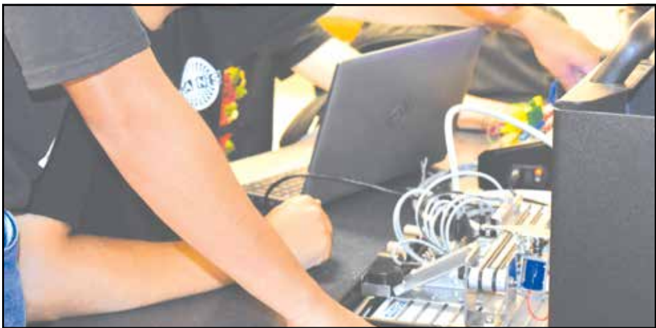
A miniature conveyor belt is controlled by remotes and code created by students.

with 24 expected to end the year with AA degrees (they started last year).