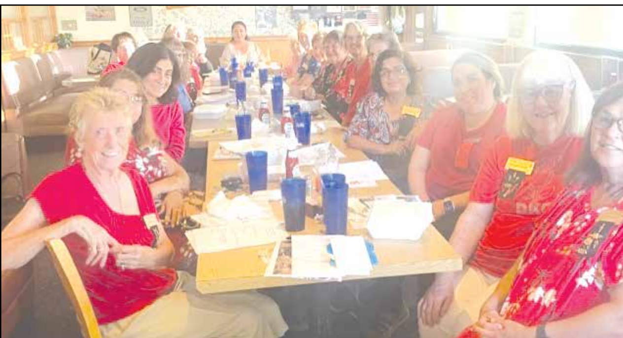
Members enjoying fellowship at a recent meeting.