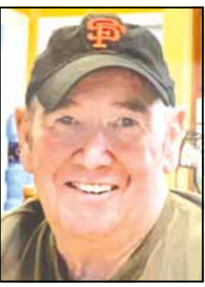
After graduating from