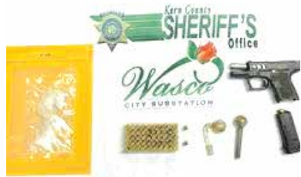
Ghost gun and suspected fentanyl were found in Vinson Callahan's possession, sheriff's deputies said.

Vinson Callahan was arrested Saturday for weapons violations, including prohibited person possessing a firearm, ammunition and suspected fentanyl. According to a press release from the Kern County Sheriff's Office, at about 10 a.m., Wasco and north area substations deputies were dispatched to the 1900 block of Gaston St., responding to a subject in possession of a firearm. Once there, they encountered Callahan. During a search, deputies located an unspecialized handgun, or "ghost gun." They also found live ammunition, drug paraphernalia and suspected