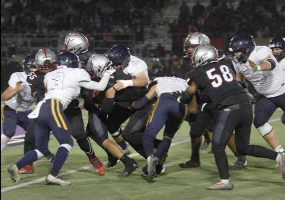
The Shafter defense stops the Toros on fourth down.