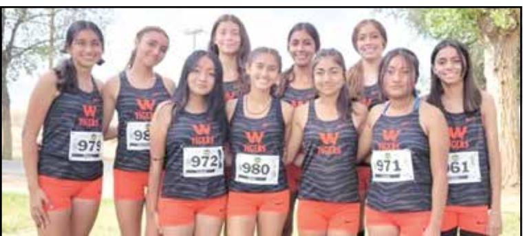
The 2021 girls cross country team were SSL champions.