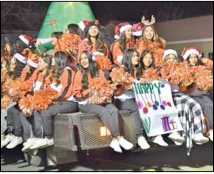
Wasco High School cheerleaders spread holiday joy at the festive parade last year.