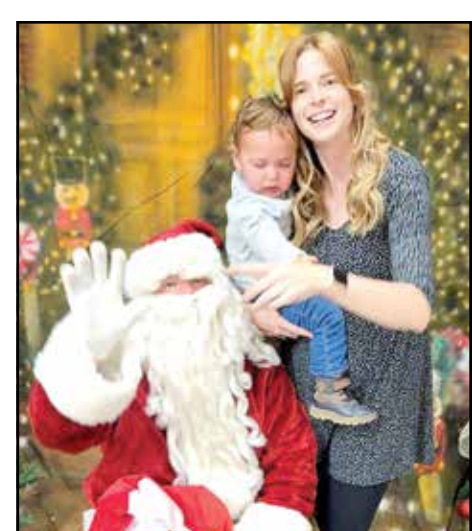
There will be pictures with Santa, like last year.