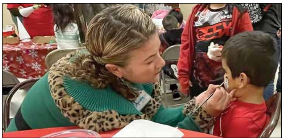
Face painting for kids was a highlight last year.