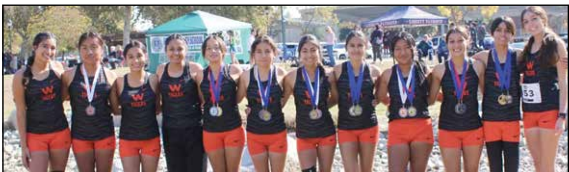
The 2022 girls cross country team is SSL champions.