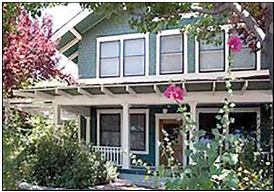
The landmark Green Hotel is often open for special events.

For information about renting the hotel for events, email thegreenhotel@gmail.com or phone 661-746-1913 and leave a message.