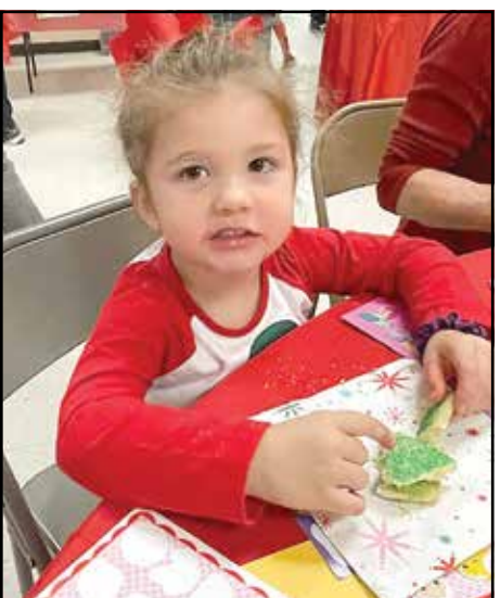
A little one enjoying the crafts at the event last year.

It will be a chance to see many beautiful Christmas trees decorated by local clubs,