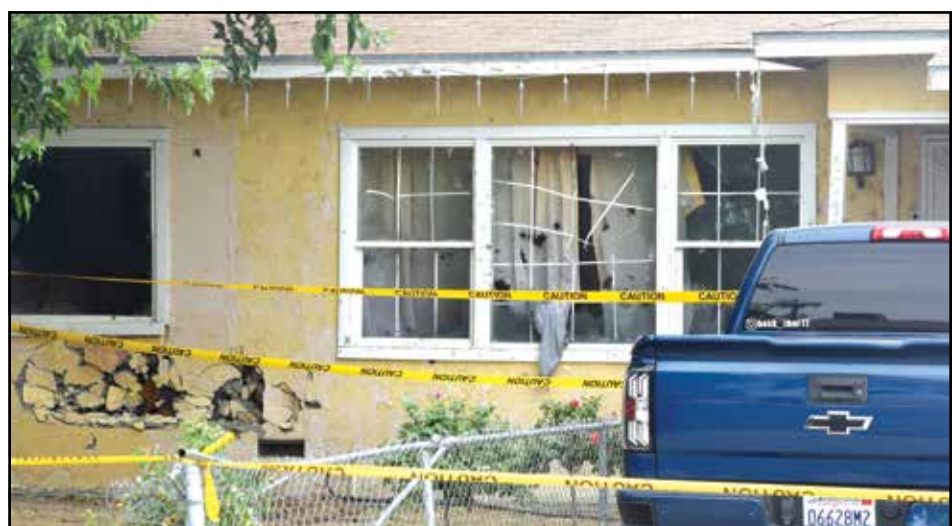
This house on First Street was the scene of the deadly standoff.

A vigil was held for the victims on Tuesday evening at a park near the Kern County Sheriff's Office Wasco Substation.