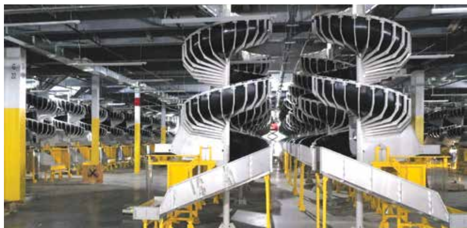
These spiral conveyors will take packages from each level to its proper section.

Current positions can be found by going to amazon.com/jobs . Additional positions will become available later this year.