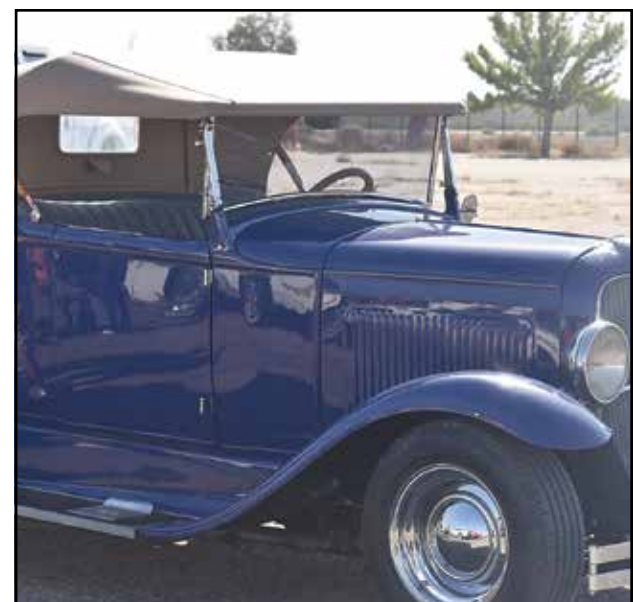
Classics were the stars of the show.