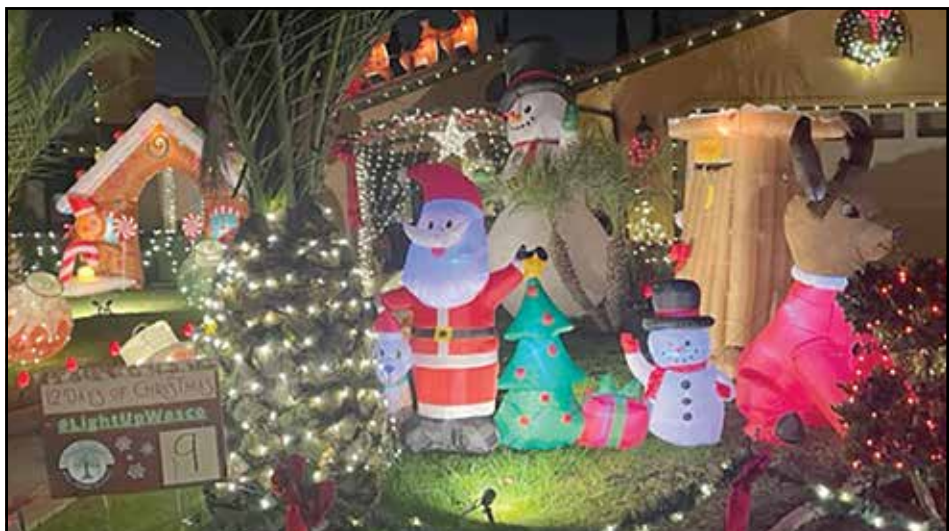
One of 18 homes that participated in the contest.

Rachel Gonzalez rode on the bus. "I hope they continue to do it again. We need more activities like this," Gonzalez