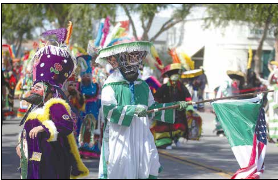
The Shafter Cinco de Mayo festival returned to the streets of the city.

Of course, April is also the month that we celebrate the Easter holiday. This year saw the return of the annual Sunrise Easter service that is held at Mannel Park at sunrise. A large crowd gathered to watch the sun rise over the trees and sings hymns and hear a wonderful message of hope and faith.