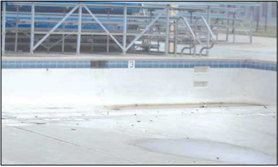
A $5 million grant was approved to renovate the Shafter Aquatic Center.

At the end of January, the city of Shafter held a ribbon-cutting ceremony celebrating the reopening of the library. The Kern County Library system had decided not to reopen the Shafter Branch of the Kern County Library, leaving the residents of Shafter without an opportunity to use a library in town, the nearest library being in the city of Wasco. The residents of Shafter, along with the Shafter City Council, and a partnership with Bakersfield College, the library reopened as the Shafter Municipal Library. The library is no longer affiliated with the County's library system. With the