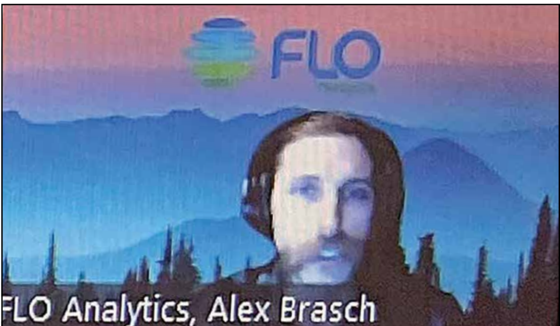
Flo Analytics was selected to lead the project analyzing the census data and developing a redistricting plan. (January)

trust, respect, integrity, teamwork, ownership and innovation. "We are committed to a purpose greater than ourselves," Hurlbert said. "What we strive to do is to make a positive difference and leave a proud legacy." The 2022/2023 six areas of focus were 1) improve and maintain the city's infrastructure, 2) enhance and modernize city facilities, 3) enhance financial stability and sustainability, 4) implement strategic economic development, 5) enhance employee development and retention and 6) define and prioritize community-building initiatives. The workshop's goal was to establish a concise and prioritized list to guide the council and staff in creating the 2022/2023 budget and capital improvement program. It was interactive, with several exercises for the council and staff attending. One of the exercises was for the council to provide their top three ideas, projects, concerns and initiatives they were thinking See WASCO Page 7