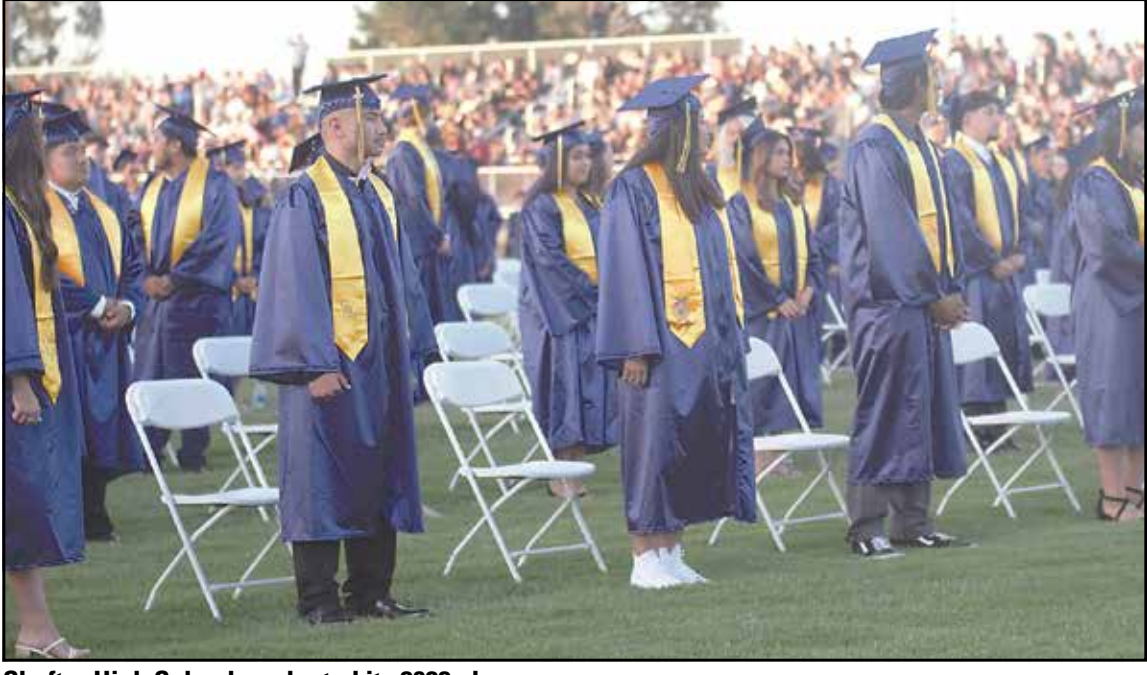
Shafter High School graduated its 2022 class.