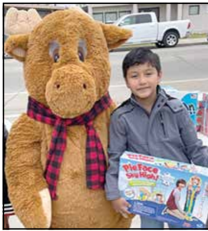
A young one posed with the friendly bear mascot proudly displaying his toy.