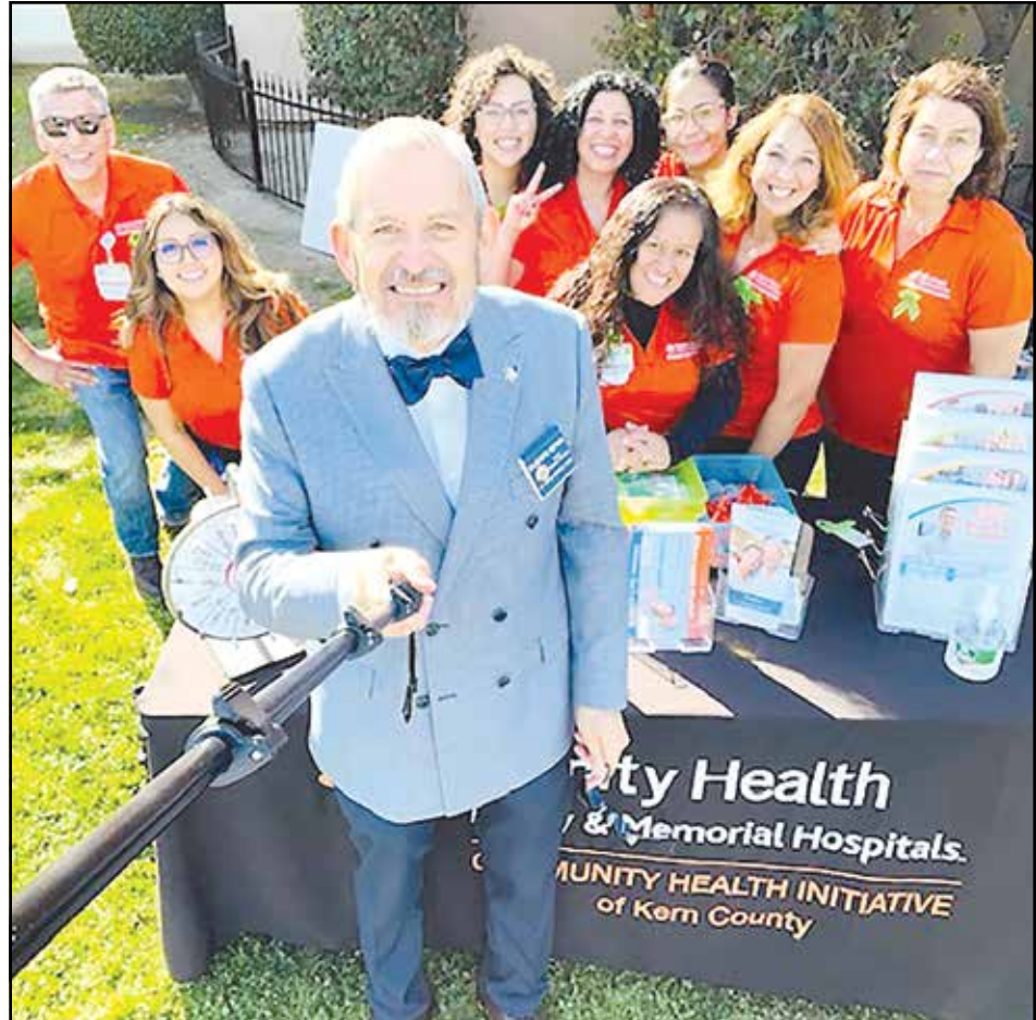
The Community Health Initiative of Dignity Health team, with Mayor Gilberto Reyna, presented a workshop to shed light on mental health. (May)