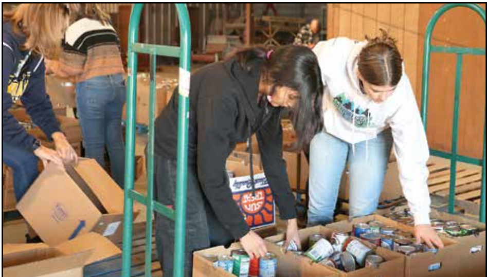
Each box contained canned goods, as well as boxes of pasta and other essentials.