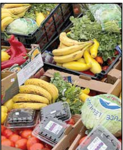
Fresh fruit and vegetables were distributed to farmworker families in need.

She said they first started dispensing to 100 families. The project has grown to provide for 500 to 600 families each month. "We are distributing in four cities, in-