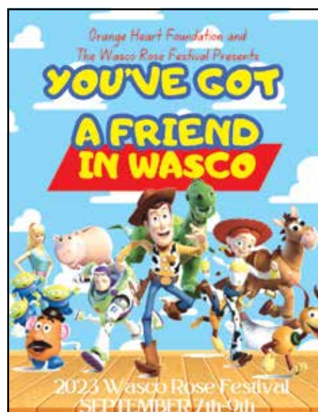
Wasco Rose Festival flyer.