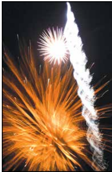
The fireworks show is one of a few shows in the county.