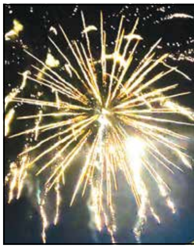
Attendees can expect an explosive and colorful fireworks show again this year.

The fireworks show attracts families from all over Kern County, with the event being one of only a few still held in the county. With