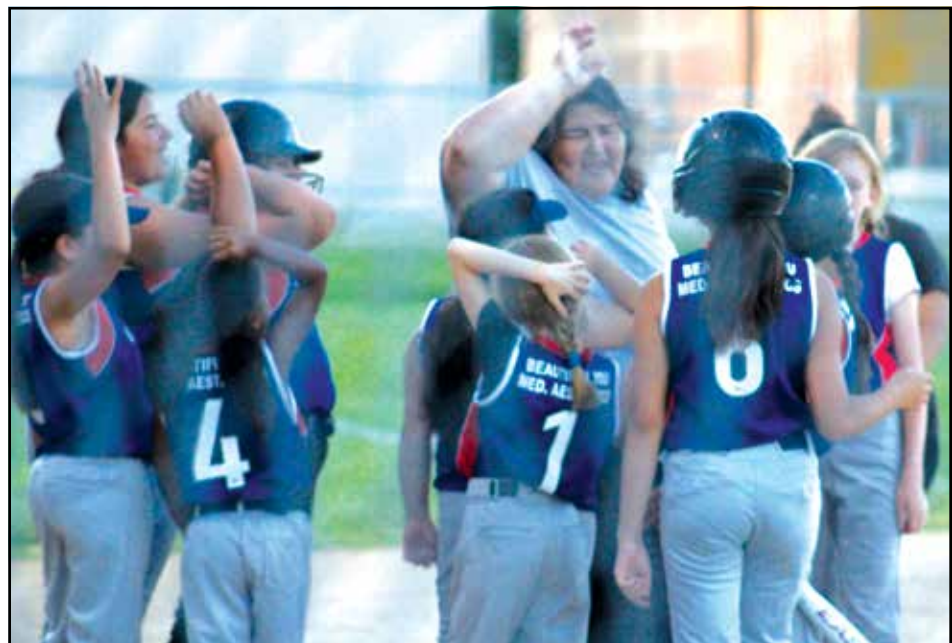
The Yankees get a come-behind win.