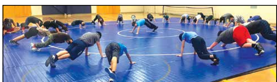
The wrestling camp teaches the kids a number of exercises and workouts.

The camp is for incoming kindergartners through sixth graders. The cost of the camp is $201 those interested can register online at shaftermb.org .