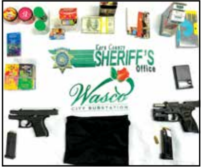
The confiscated firearms and other illegal paraphernalia.

Three men from Wasco were arrested on Tuesday morning for allegedly brandishing a firearm and other charges.