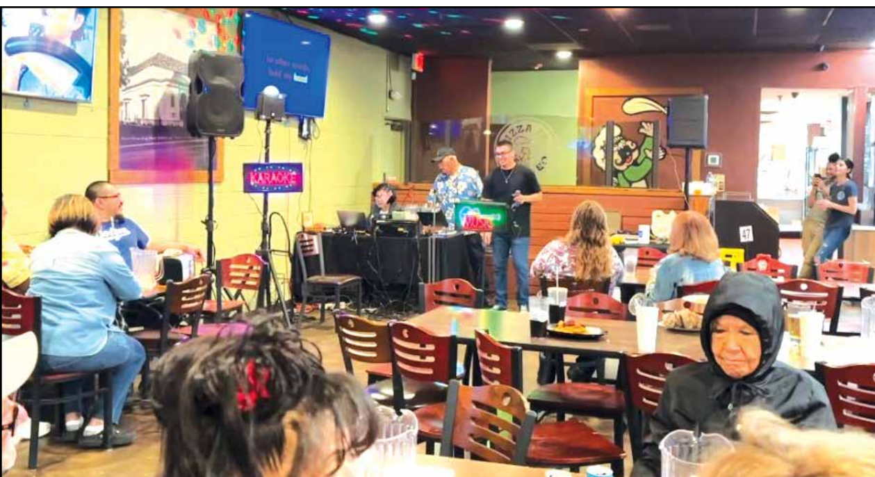
Pizza Factory has a dining room that can fit up to 200 people in a fun, family environment.