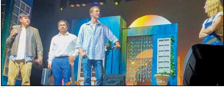
The three men are caught by Donna.