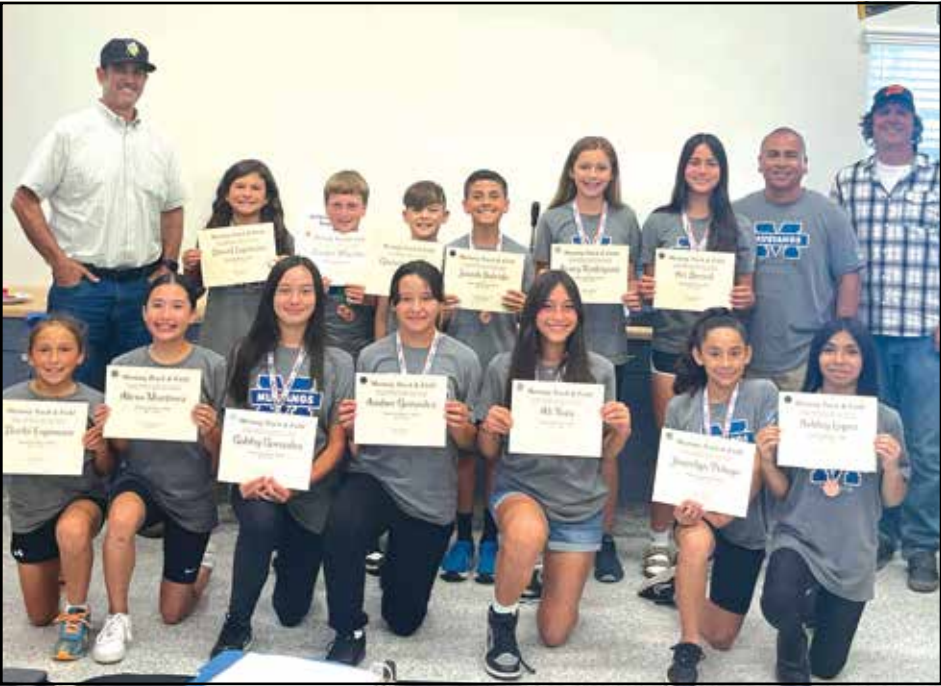
The Maple team took home 14 medals from the Valley Championship meet.