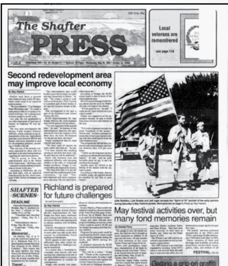
The front page, May 26, 1993