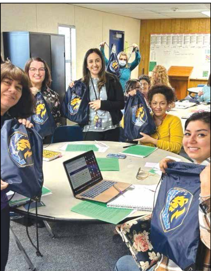
Redwood Elementary School recognized their hard-working staff.

Presale tickets are $20 and can be purchased at the dance studio, 641 F St., from 4 to 8 p.m., Monday through Thursday. Tickets at the door are $25.