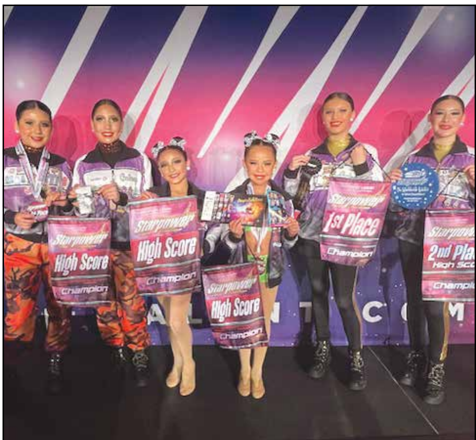
Team Galaxy 2023 will kick off the show.