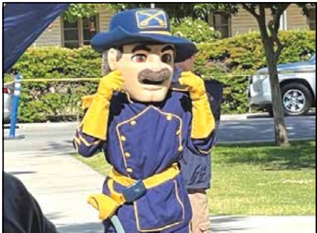
The Trojans were able to meet the Shafter Generals mascot.