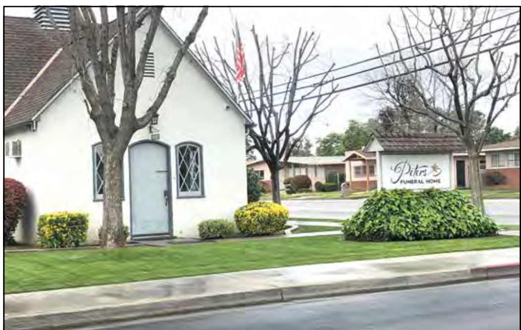
Peters Funeral Home in Wasco is limiting visitors.

Woody said they also are giving families who opt for a straight graveside service the option of holding a memorial service for their loved one in their chapel free of charge – and restrictions -- once the virus situation is resolved. "They will be able to hold a memorial service with no charge. It would just be with no casket."