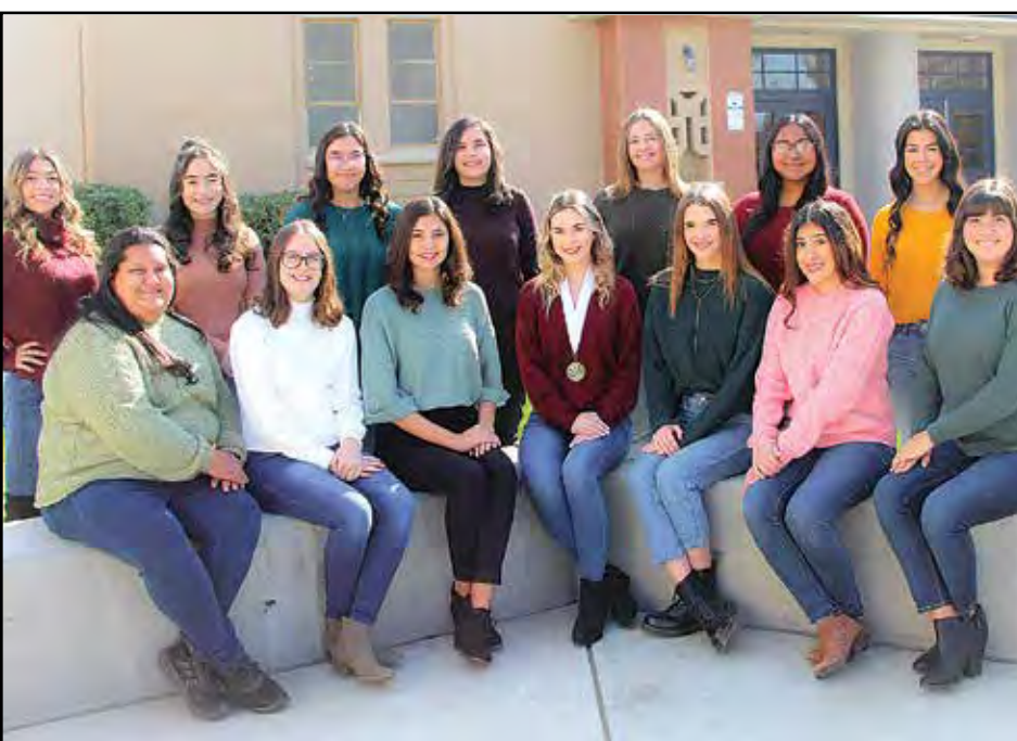
The slate of 14 contestants will have to wait until June to compete for the DYW title.