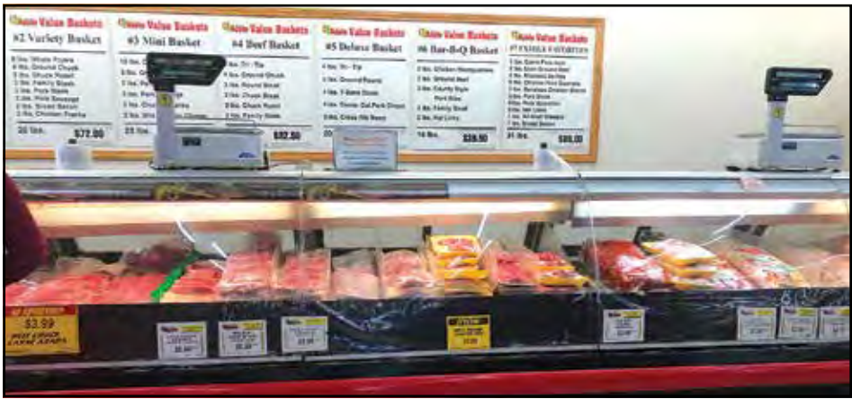
Apple Market had a great variety of meats.